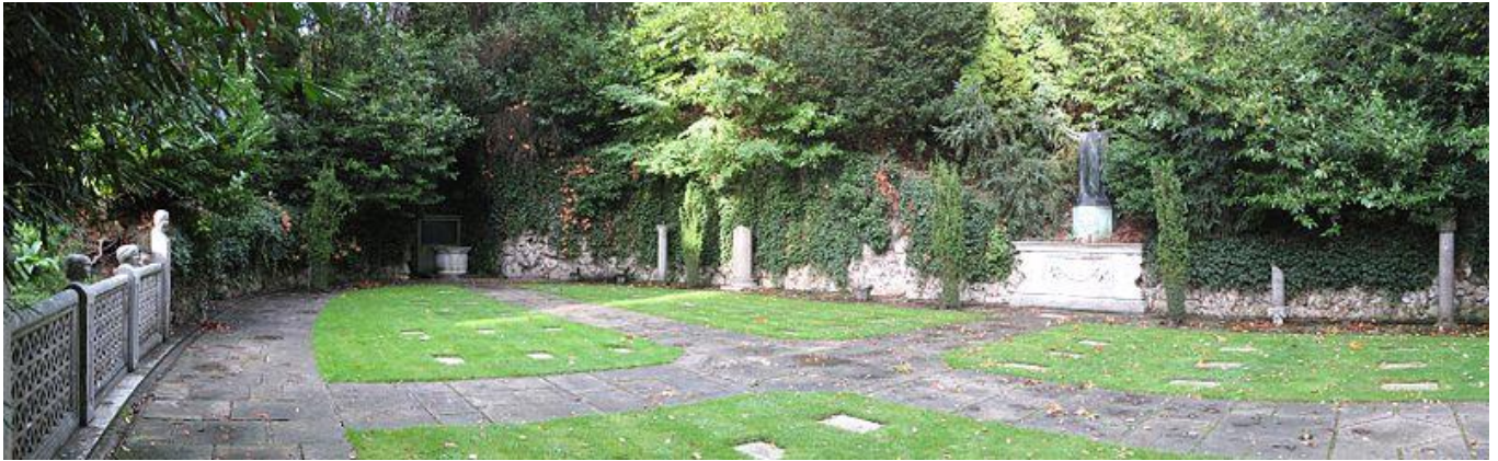
Cliveden War Cemetery