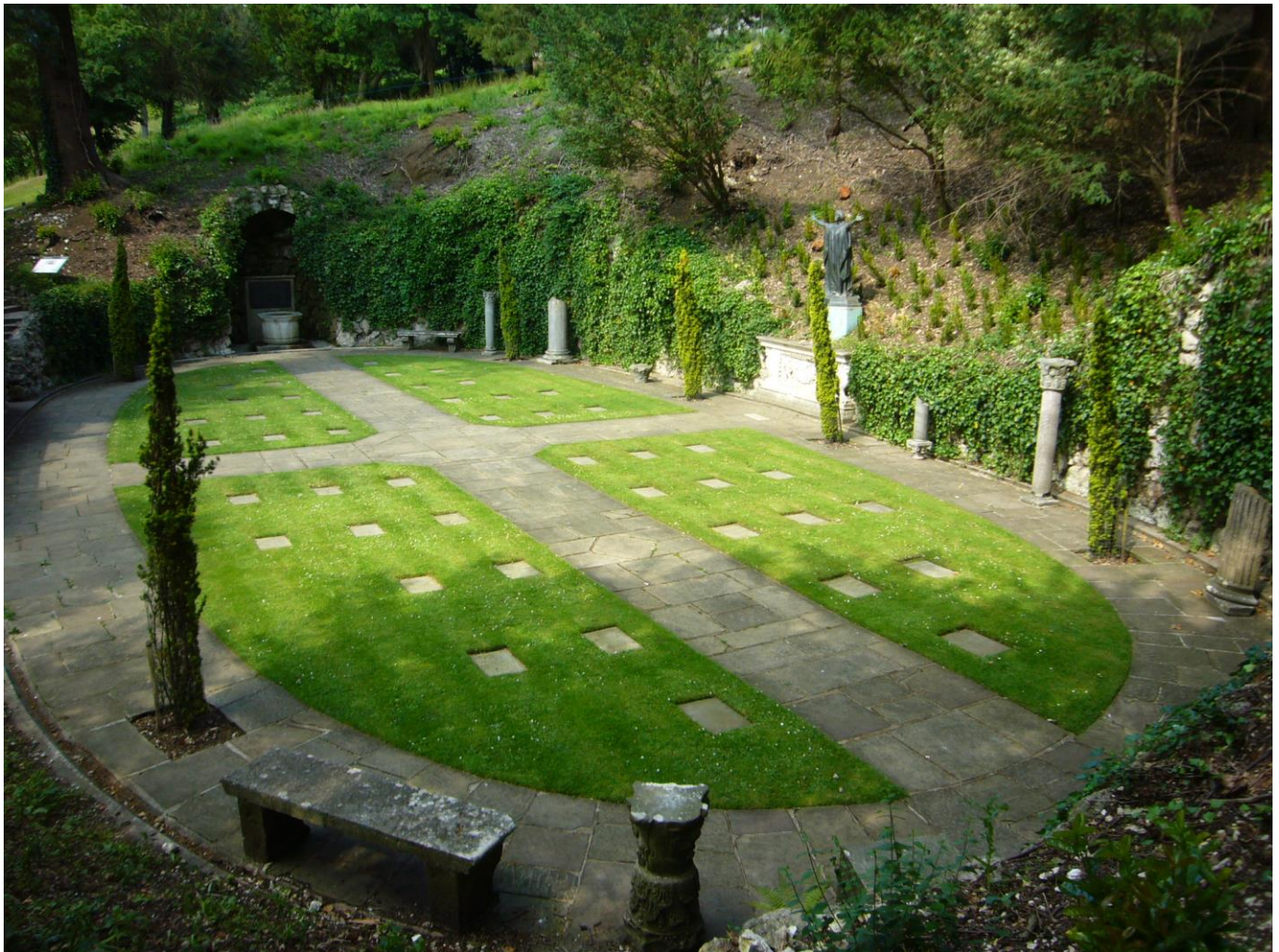
Cliveden War Cemetery