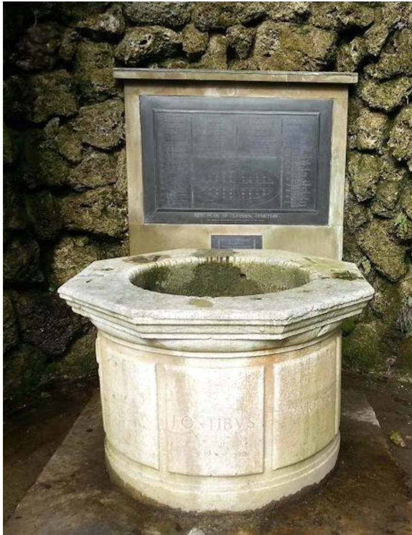
Key Plan of Cliveden War Cemetery Plaque